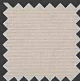
7500 R17 Dune