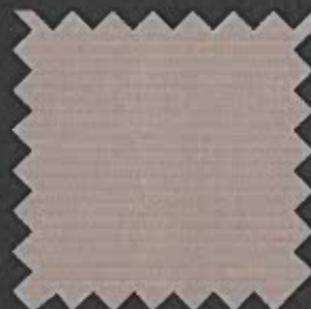
7500 R19 Stone