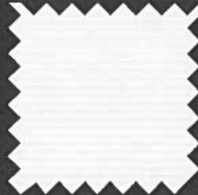
7500 R39 Cloud