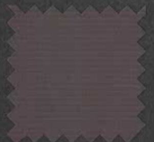
7500 R21 Orient