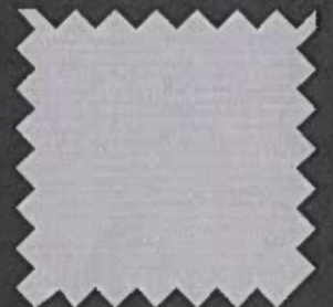
7500 R43 Tundra