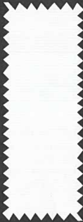
7500 R13 Ice