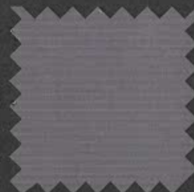
7500 R20 Odyssey