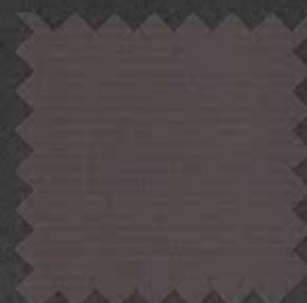
7500 S97 Orient x2