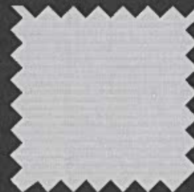
7500 R42 Nimbus