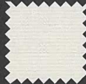
7500 R40 Porcelain