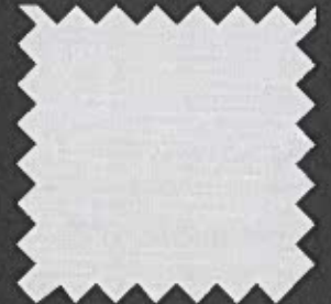
7500 R41 Limestone