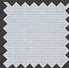
7500 R97 Mist